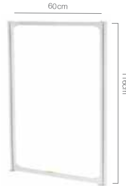
MULTISTORE FRAME 116cm Cat. No. H 3361120 1160