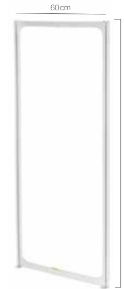
MULTISTORE FRAME 200cm Cat. No. H 3362000 2000